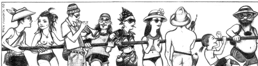
"Hmm, should I go for her, or that Ranger man?"

The theme camp member was taken away in a calm and orderly fashion by Sheriff's personnel to an undisclosed location for questioning about the alleged assault. ☺